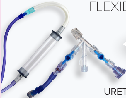
TraxerFlow™ Ureteroscopy Tubing Set