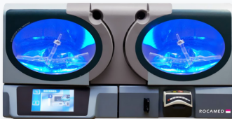
With EndoFlow II double chamber